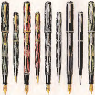
No. 44-B Emerald Bay Ink-Vue Pen (with gold- filled mountings), $4.95 No. 44-B Emerald Bay Ink-Vue Pen (with steel mountings) $3.95

(Available with nib actions described on center spread)